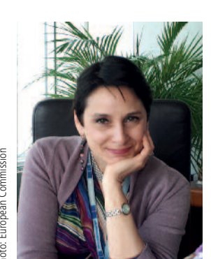
Veronica Manfredi: 'We must increase the speed of global, European and national efforts against climate change.'

The Director for Quality of Life at the European Commission's Directorate-General for Environment Veronica Manfredi remarks: 'Climate change is associated with many different health risks. We must increase the awareness of these risks and also accelerate the speed of global, European and national efforts to reduce its pace and stop it completely'. Civil action can make a considerable